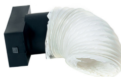
Pipe Adapter Kit 4101