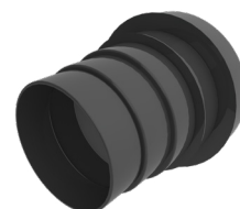
Multi Adapter RTV-ADMULTI