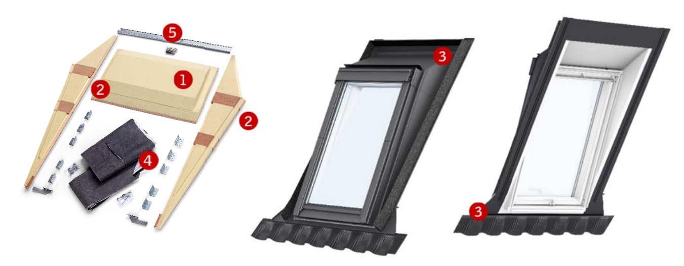
Illustrations show VELUX Mini Dormer with kerb flashing EAZ