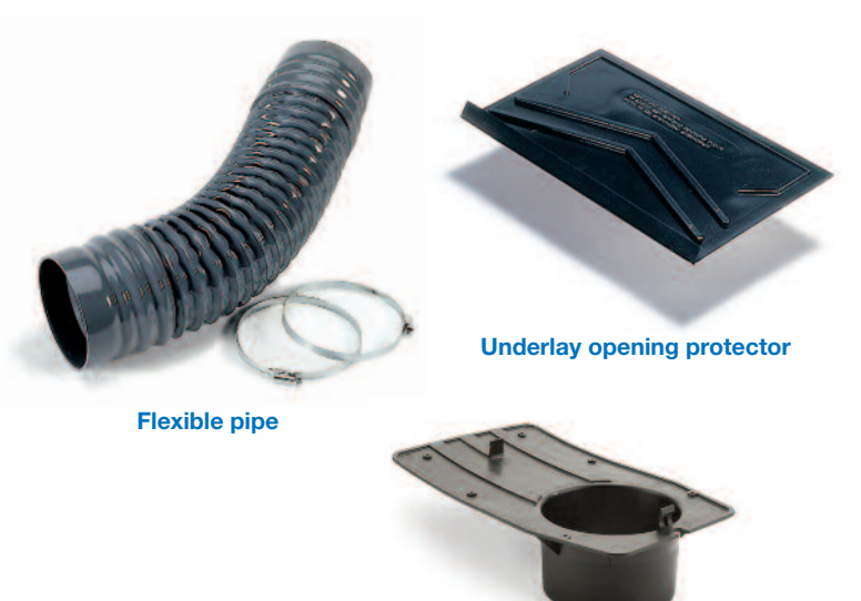
Glidevale GV110 pipe adaptor

Manufactured from ABS and polypropylene material with coated flexible aluminium AluFlash on the front leading edge for a high quality of finish and robust construction. All exposed surfaces are coated with a durable water based, colour blended surface treatment. This surface treatment has been used on all Glidevale slate and tile ventilators for over 20 years and after this time shows only a marginal lightening of shade which is usually counteracted by the effect of atmospheric pollution on the roof covering itself.