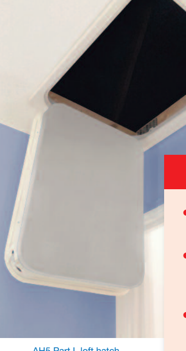
AH5 Part L loft hatch

All frames except for the AH6 are injectionmoulded polypropylene.