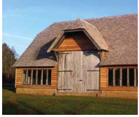
Hardrow<sup>®</sup> Slates Duets<sup>®</sup> Barley on a Barn Conversion at Chesterton, Oxon