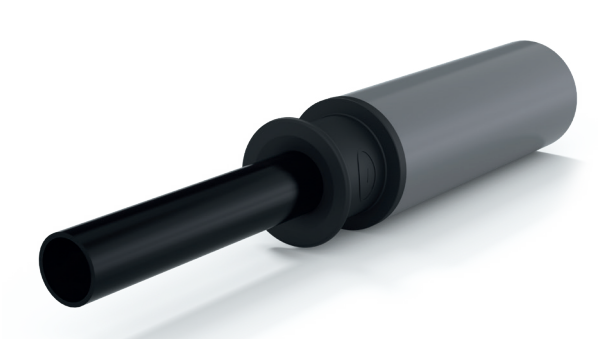
3. Push the second pipe onto/into the opposite end of the coupling.

Note: When pushing the pipe onto/into the coupling, ensure correct installation by aligning both pipes with the products central pipe stop. Lubrication \ may \ be \ required, if so \ use \ sparingly, water \ is \ recommended.