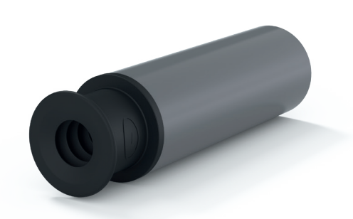
2. Push the coupling onto/into the first pipe up to the pipe stop