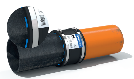
3. Align the pipes and slide the coupling onto the other pipe, ensuring the coupling face and marked line are flush. Tighten this clamp band.