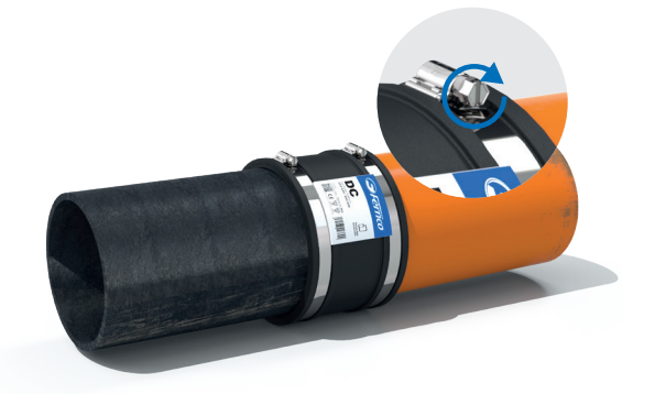
5. Tighten the clamp bands to the recommended torque.

Tamp the bedding under the pipe and re-tighten prior to backfilling.