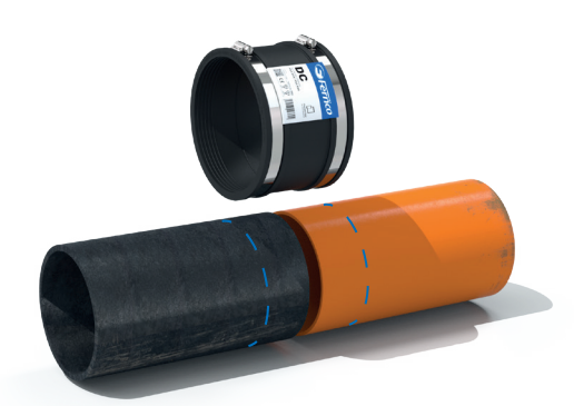
1. Mark both pipes, from the end to be connected, half the width of the coupling, less the required joint gap, which is usually 10mm.