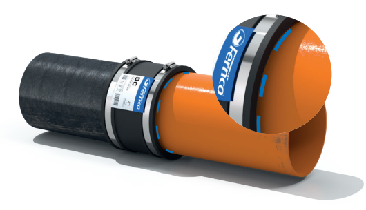
4. Position the remaining pipe, ensuring the coupling face and marked line are flush. Tighten this clamp band.