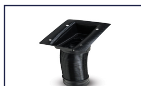
Product code: RSPA