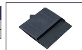
Product code: TV10/10