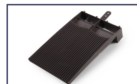
Product code: TV10/5