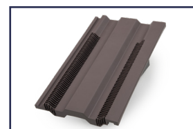
Product code: TV10/6