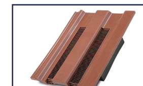
Product code: TV15/4