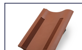
Product code: TV10/8