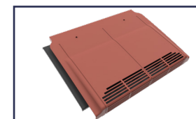
Product code: TV10/11