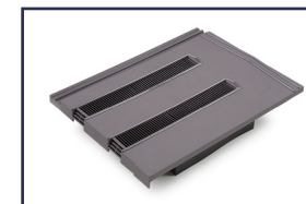
Product code: TV15/1