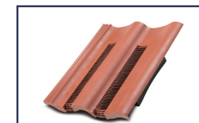
Product code: TV15/2