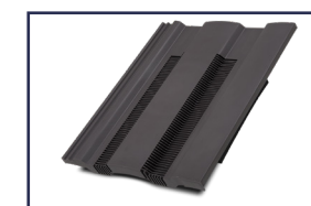
Product code: TV15/7