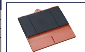
Product code: TV10/9