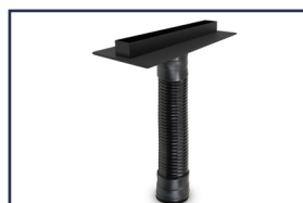
Product code: PCSPA