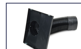
Product code: TVSPA

Note: PCA, TVA and DPCA are adaptors only