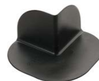
TPE external corner medium