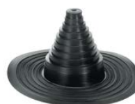
TPE base fittings for pipes