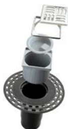
TPE roof drain with side or vertical exit