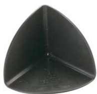
TPE internal corner medium