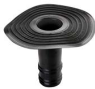
Roof drain "EURO" made of TPE with a 250 or 400 mm spigot