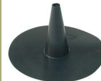
TPE conical base fitting for pipes