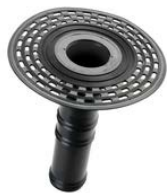
Roof drain "GENIUS" made of TPE with a 250 or 400 mm spigot