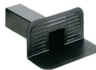
TPE angular drains