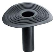
"MONDIAL" roof drain made of TPE with a 170 or 250 mm spigot