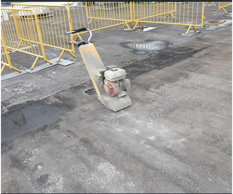
Scabbler used to remove the stone chippings that were embedded into the surface