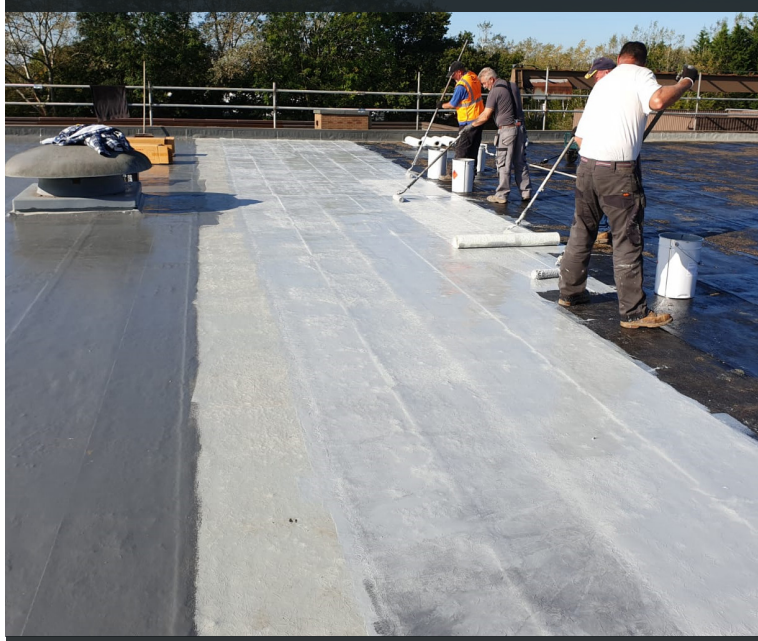
Base Coat and Reinforcement Matting being embeded into the base coat of FastCoat Pro