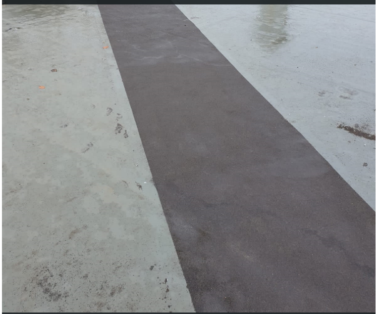
100lm of walkways installed over the completed Fastcoat Pro roof using LRS Fastcoat Pro Traffic Coat