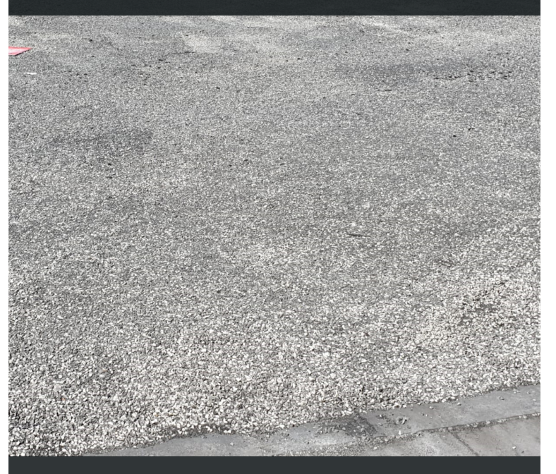
Stone chipping surface prior to being scrabbled