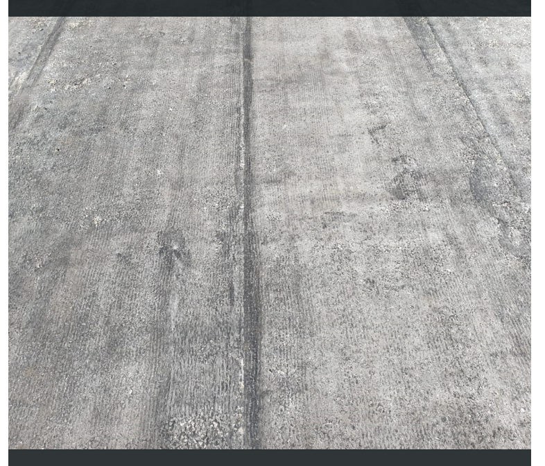
Once the felt had been scrabbled the surface was smooth ready to accept the FastCoat Pro.