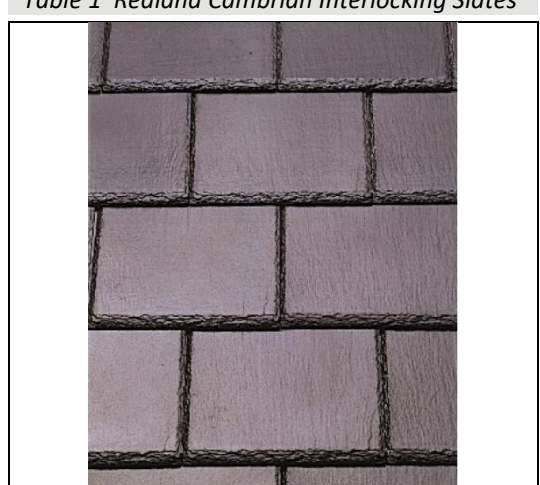
Table 1 Redland Cambrian Interlocking Slates

1.1 Redland Cambrian Interlocking Slates are glass fibre reinforced polyester resin, crushed slate and fillers, roofing and cladding slates. When installed the product gives the appearance of natural riven slate (see Figure 1).