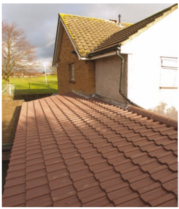
Red Centurion on a private house extension in Speedwell, Bristol.