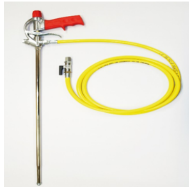
Gun & Hose kit

NOTE: INSTA-STIK can also be applied on to the insulation board. Where possible beads should run across the width of the insulation boards rather than the length.