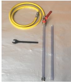
Wand & Hose Kit

NOTE: INSTA-STIK can also be applied on to the insulation board. Where possible beads should run across the width of the insulation boards rather than the length.