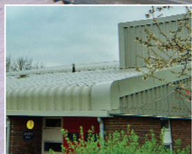
Sports hall roof refurbishment, Newbury, Berkshire

This roof in Darlington, had previously been sprayed with urethane foam in an attempt to cure water ingress. The foam had reacted to the asbestos cement, resulting in increased water ingress. Filon over-roofing solved the problem.