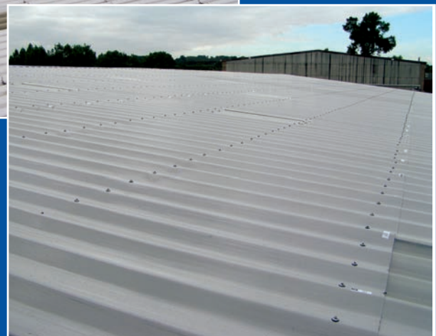
A factory roof in Camberley, Surrey, before and after refurbishment with Filon over-roofing